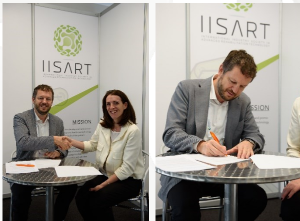
Signing during Rehab Week 2017